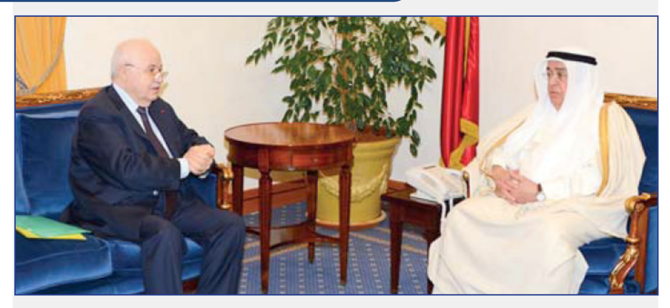
Manama, Bahrain, January 28th, 2014

H.H. the Deputy Prime Minister of Bahrain welcomed the concept of BahREN