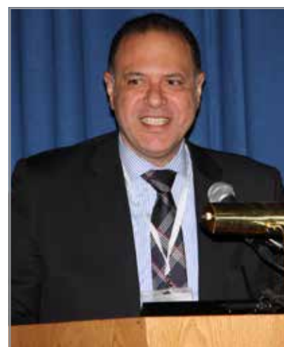
Ayman El-Sherbiny, UN-ESCWA, Lebanon